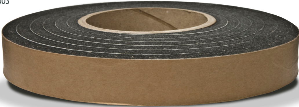
Acrycell Sealing Tape 1 Inch - Part No. 10108-002